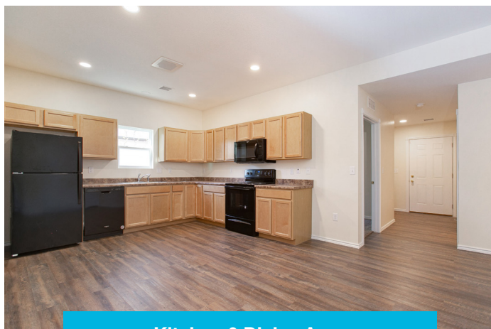
Kitchen & Dining Area